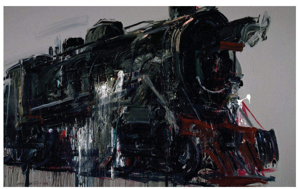
Cui Guotai, Liberation Engine , 2006, acrylic on canvas,180 x 290 cm.

Mao Zedong deemed the pictorial arts to be extremely important. He commissioned committees to formulate and enforce the desired content of art as well as an appropriate style. While Western-style, realistic portrayal of events was highly effective and sustained by visiting Russian arts in the 1950s, Mao wanted a national art that could appeal to and educate the largely illiterate populace. Artists were challenged to create works that were persuasive, well-executed, and looked Chinese. Often, they employed the traditional medium of pen and ink, made modern with the addition of bright colors and techniques that rendered the forms in three dimensions—perspective, highlighting, and shading. They were also