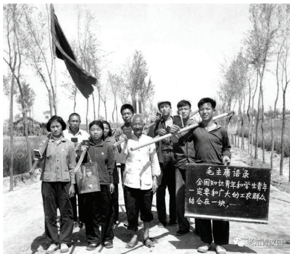
Educated youth being "reeducated" in the countryside