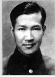
Xian Xinghai (1905-45), composer of the Yellow River Cantata