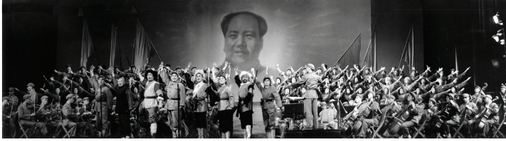
Shanghai Symphony Orchestra performs “Taking Tiger Mountain With Strategy” during the Cultural Revolution.

In 1978, the Central Conservatory became the first conservatory to reopen; it initially recruited for 100 spots but expanded to 200 when it received 18,000 applications. Its first composition class included Chen Yi, Zhou Long, Ye Xiaogang, Guo Wenjing, Tan Dun, Chen Qigang, and Liu Suola, to name just a few of its now world-renowned composers. As China opened its doors to the outside world in the 1980s, many of these young composers left to study and work overseas, where opportunities were more abundant. Even as they continued to seek musical inspiration from their homeland, most of their work was commissioned, published, and performed outside China. In 2001, the New York Times remarked on this phenomenon with a story headlined “The Sound of New Music is Often Chinese.” Xiao Youmei’s despair at China’s absence from the global classical music conversation had been remedied in just the way he predicted, with, as the Times put it, a “contingent” of symphonic composers from China.