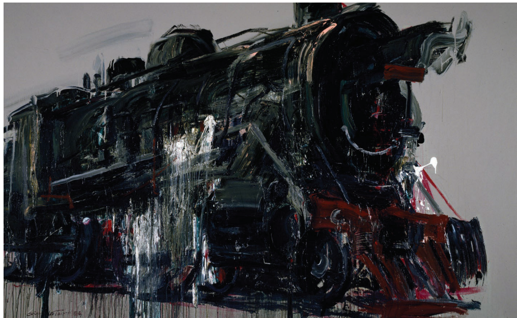
Cui Guotai, Liberation Engine , 2006, acrylic on canvas, 180 x 290 cm.

Mao Zedong deemed the pictorial arts to be extremely important. He commissioned committees to formulate and enforce the desired content of art as well as an appropriate style. 1 While Western-style, realistic portrayal of events was highly effective and sustained by visiting Russian arts in the 1950s, Mao wanted a national art that could appeal to and educate the largely illiterate populace. 2 Artists were challenged to create works that were persuasive, well-executed, and looked Chinese. Often, they employed the traditional medium of pen and ink, made modern with the addition of bright colors and techniques that rendered the forms in three dimensions—perspective, highlighting, and shading. They were also