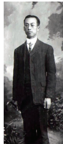
Xiao Youmei (1884-1940), composer and music educator