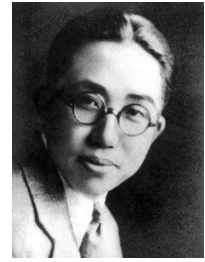
Huang Zi (1904-38), composer and music educator

The trajectory of symphonic music development in China was irrevocably altered by the Japanese invasion, which led many budding young classical musicians to question their paths. Some continued their studies but also joined the National Salvation Song Movement, composing patriotic songs intended to encourage their fellow citizens to resist the Japanese. Nie Er, for example, was a young musician from southwest China who had moved to Shanghai to study violin. But following the horrific 1932 Japanese bombing of the civilian population of Shanghai's Zhabei district, he scrawled in his journal, "After a few years, even a decade, I become a violinist. So what? Can you excite the laboring masses by playing a Beethoven sonata? Will that really be an inspiration to them? No! This is a dead end. Wake up before it's too late." Nie Er then became politically active and started composing music that reflected the lives of dockworkers, coolies, and other ordinary people; in 1935, he wrote the patriotic song "March of the Volunteers," which is now the national anthem of the People's Republic of China (PRC). (Nie Er, too, died before he could fulfill his potential, drowning on a beach outing when he was 23.)